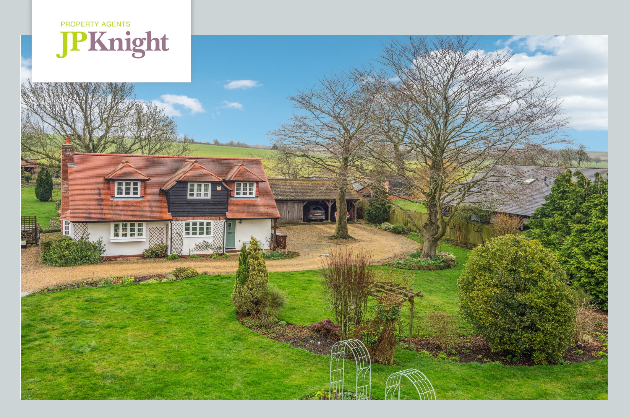
Roke, Nr Wallingford OX10 6JD