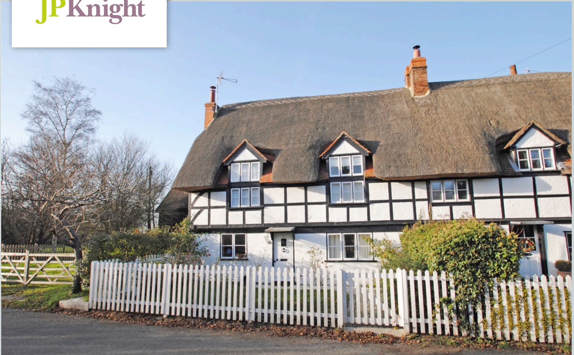
Barn Cottage, Little Wittenham OX14 4RA