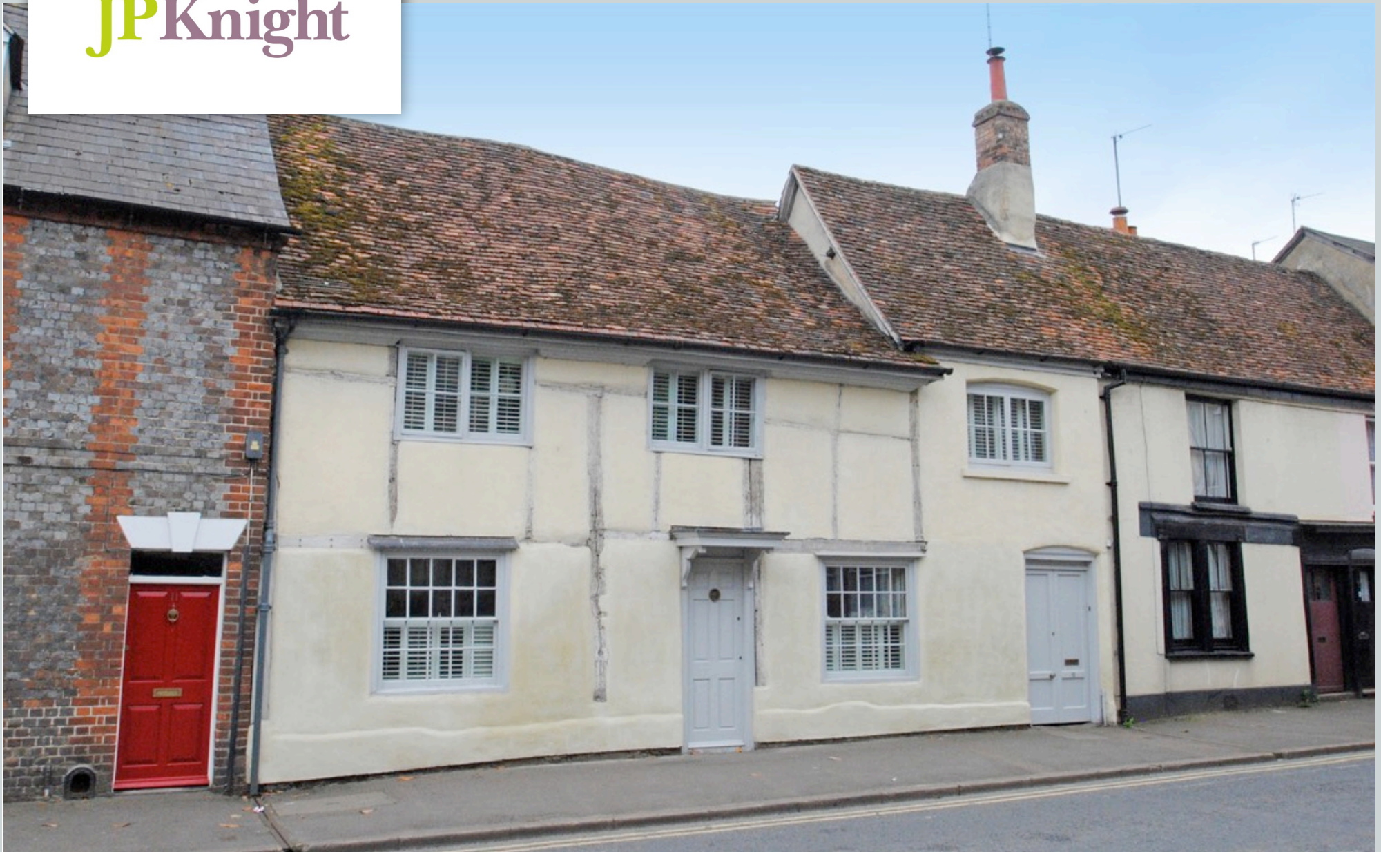
High Street, Wallingford OX10 0BP