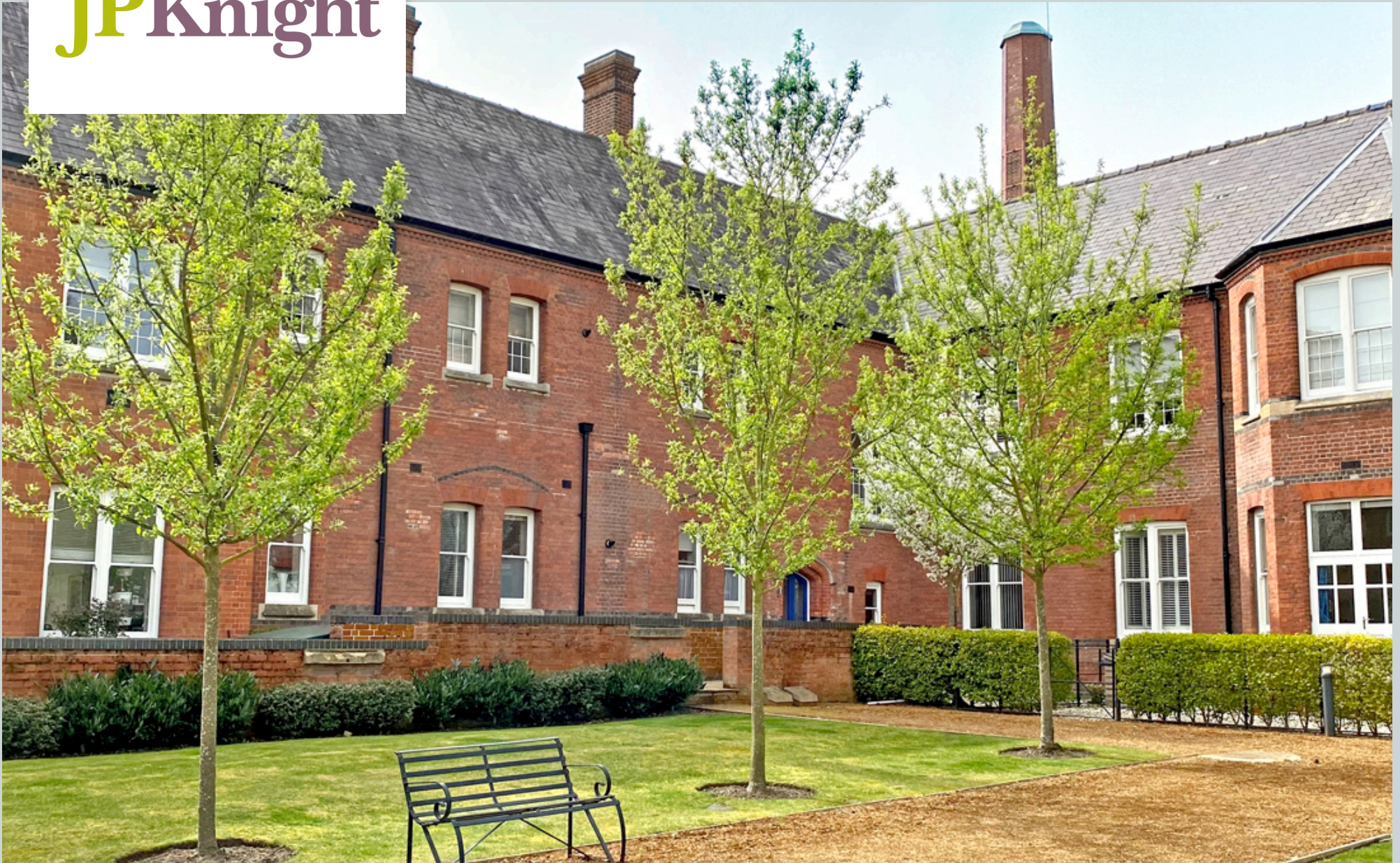
Ridgeway Court, Cholsey OX10 9GU