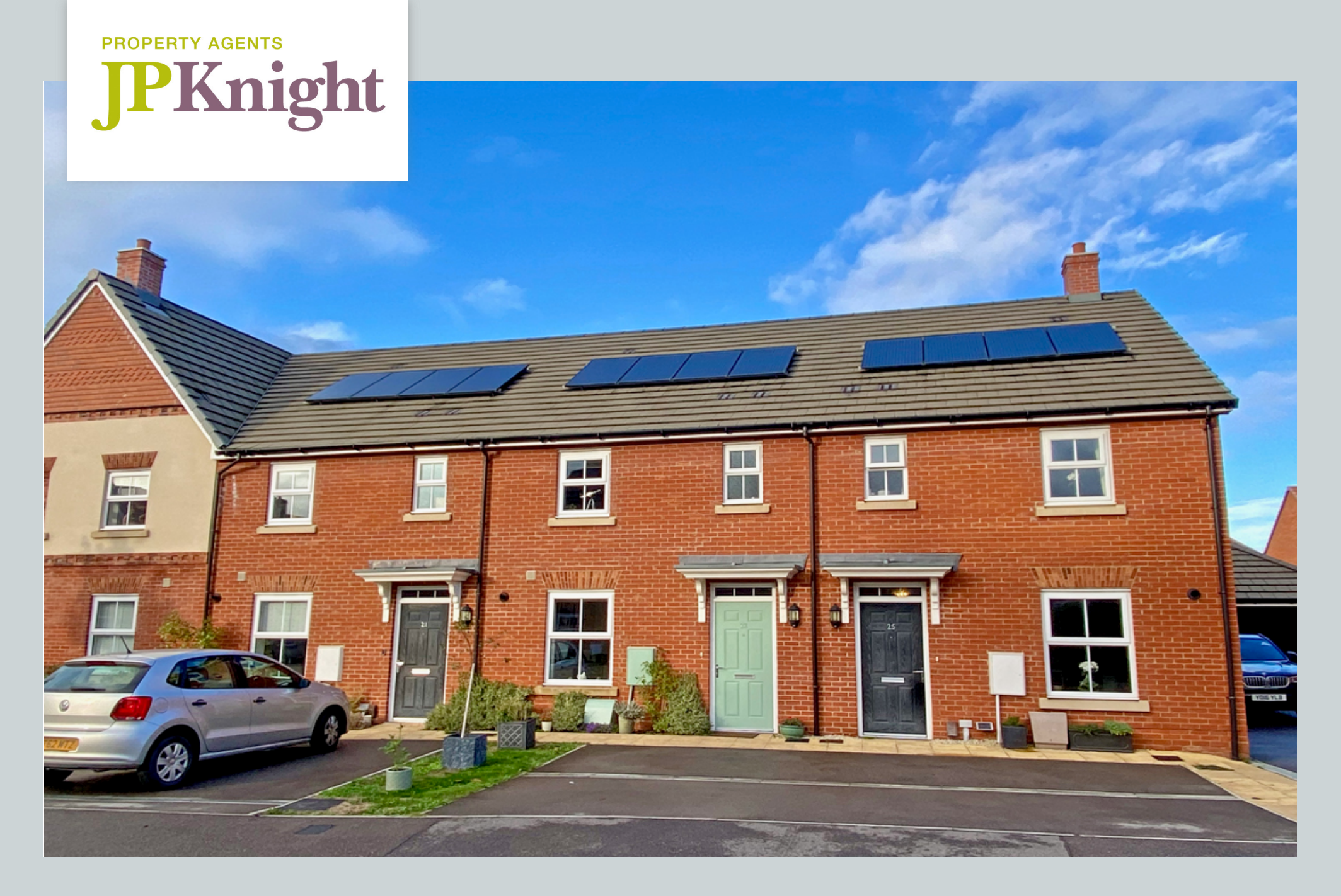
Imray Place, Wallingford OX10 9FW