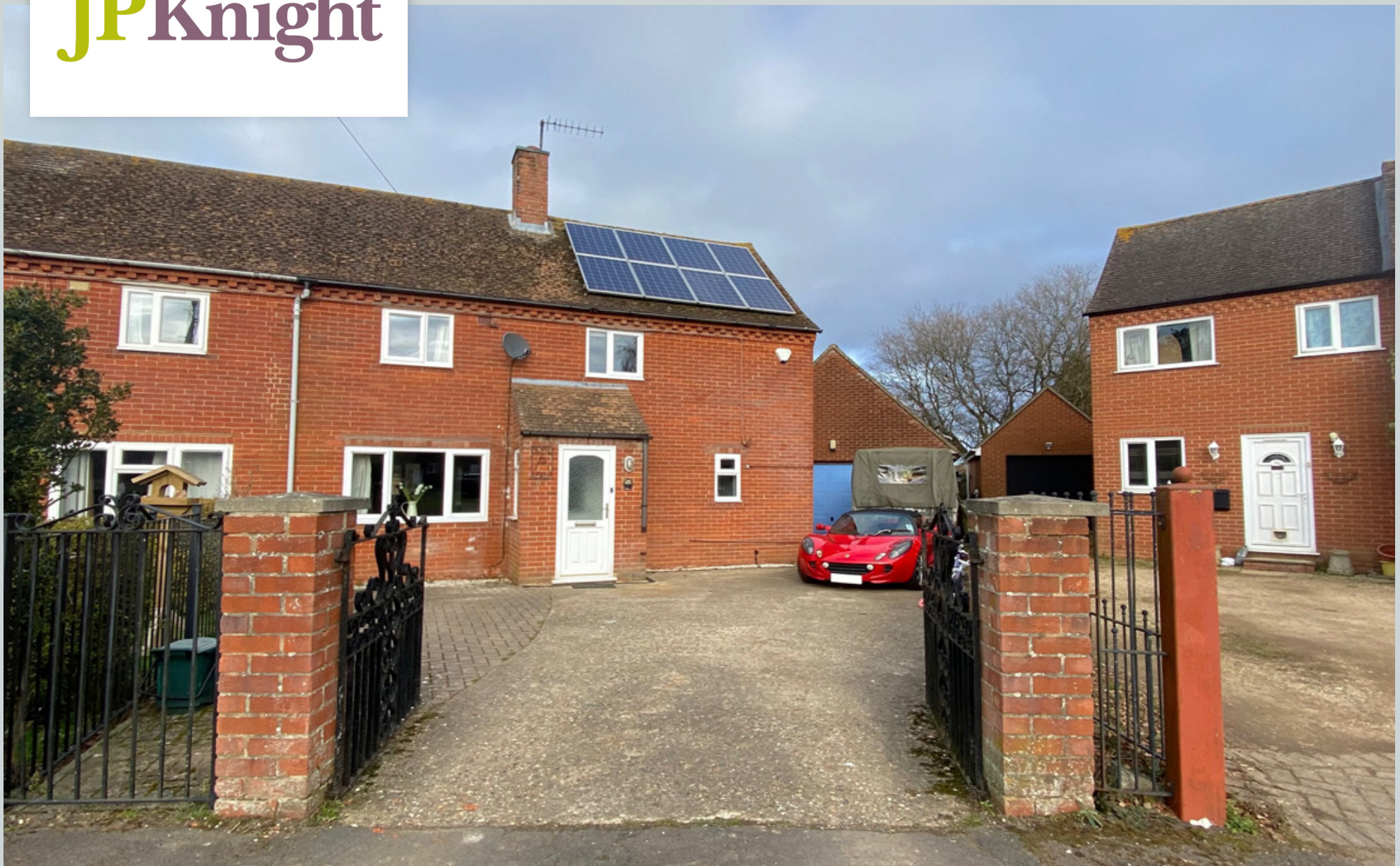
The Close, Woodcote, RG8 0SB