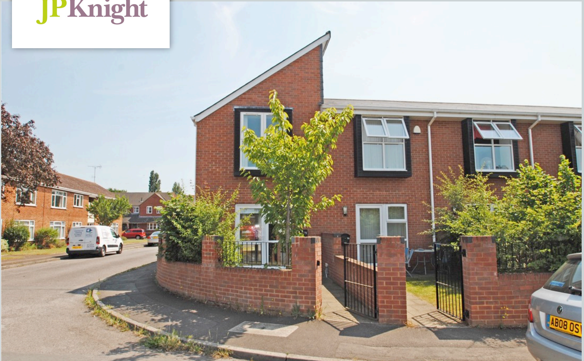
Charter Way, Wallingford OX10 0TD